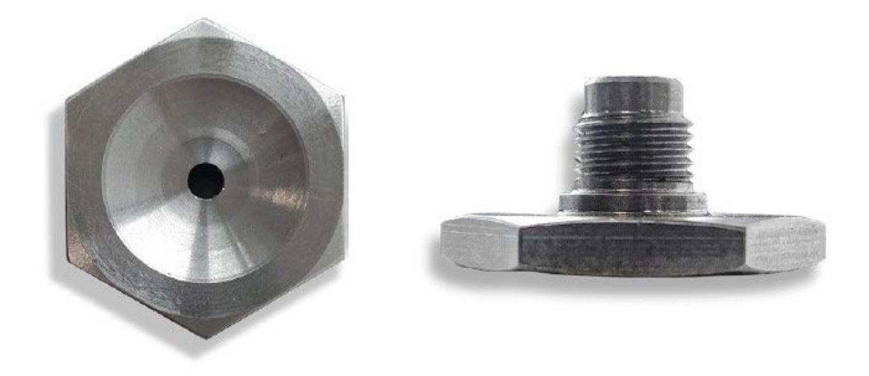
Image 4 – Vitrafix Nose Piece Adapter to suit Vitrafix A3 stainless steel rivets

When caring out works on site, once the panels are installed, including those that require the use of glues, silicones, or sealants, care must be taken not to mark the Ceramapanel<sup>®</sup> A1 panels with such products, which would result in irreparable damage.